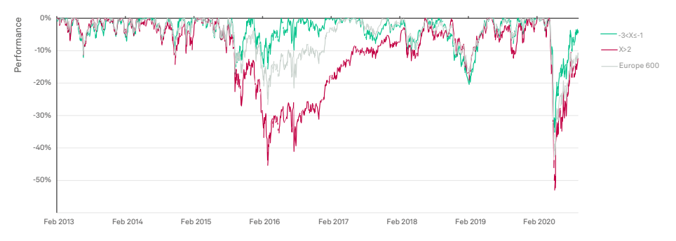
Figure 5 – Underwater Equity Curve / max. drawdown for the Europe 600, 'Most Aligned', and 'Least Aligned' XDC Gap ranges

Up to this point, the empirical results support our hypothesis. However, to complete the picture resilience must be considered alongside risk-adjusted returns. As a historical underwater equity curve shows, the 'Most Aligned' stock selection proved to be more resilient in 2016 and 2020, compared to the 'Least Aligned' (see Fig. 5). However, it failed to provide an advantage in 2018. Overall, the maximum drawdown of -30.6% for the 'Most Aligned' range clearly improves the tail risk profile. But, perhaps more remarkably: The 'Least Aligned' range exhibits not only a persistent weak tail risk profile, but also the highest maximum drawdown of -42.6% of all subsets considered in the analysis. Besides, the 'Most Aligned' range shows a Sortino Ratio of 0.84 overall, while the 'Least Aligned' only achieves 0.14.