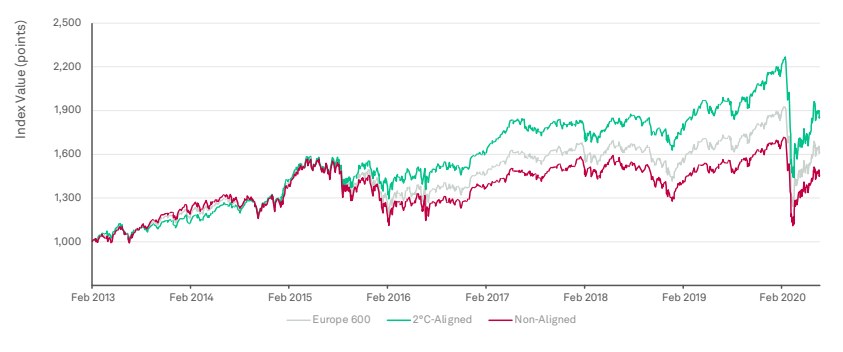
Figure 1 - Returns for the Europe 600, the 2°C-Aligned, and Non-Aligned categories

The maximum drawdown was greater for the 2°C-Aligned securities at -36.5% versus -35.5% for the Non-Aligned securities.